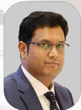
Dr. TRB Rajaa Minister of Industries, Govt of Tamil Nadu.