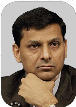
Dr. Raghuram Rajan Former Governor of RBI 7th Chief Economist of the International Monetary Fund.