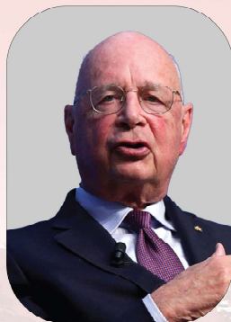
Prof. Dr. Klaus Schwab Founder & Executive Chairman, World Economic Forum.