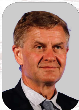
Mr. Erik Solheim Former Foreign Minister of Norway, President of Green Belt and Road Institute.