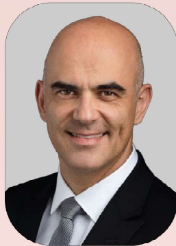
Mr. Alain Berset President of Switzerland.