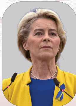
Mrs. Ursula Von der Leyen President, European Union Parliament.