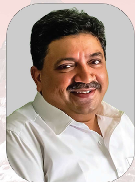
Dr. P. Thiagarajan Minister of Information Technology and Digital Services, Govt of Tamil Nadu.