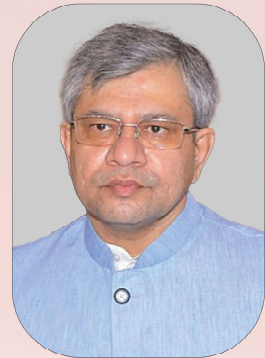
Mr. Ashwini Vaishnaw IAS Minister of Communication, Electronics and Information, Govt of India.