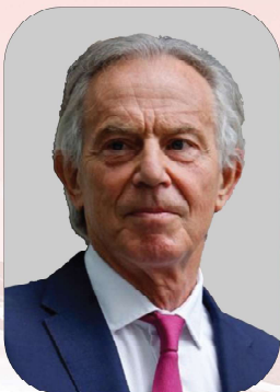
Mr. Tony Blair Former Prime Minister of the UK.