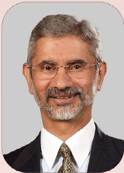
Dr. S. Jaishankar External Affairs Minister of India.

The following are the High Profile Resource Persons we have in mind. They will be contacted, confirmed and officially communicated before January 31, 2024.