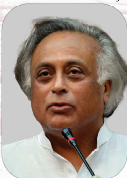
Mr. Jairam Ramesh Former Union Minister, Govt of India.